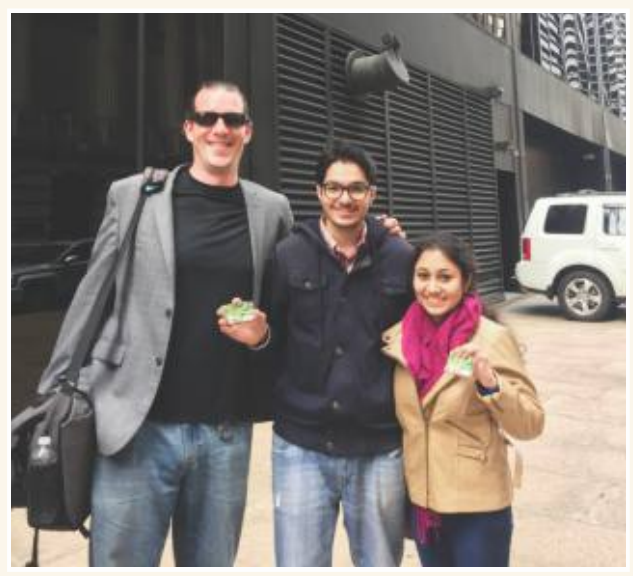
Winners of NYSE Trading Game