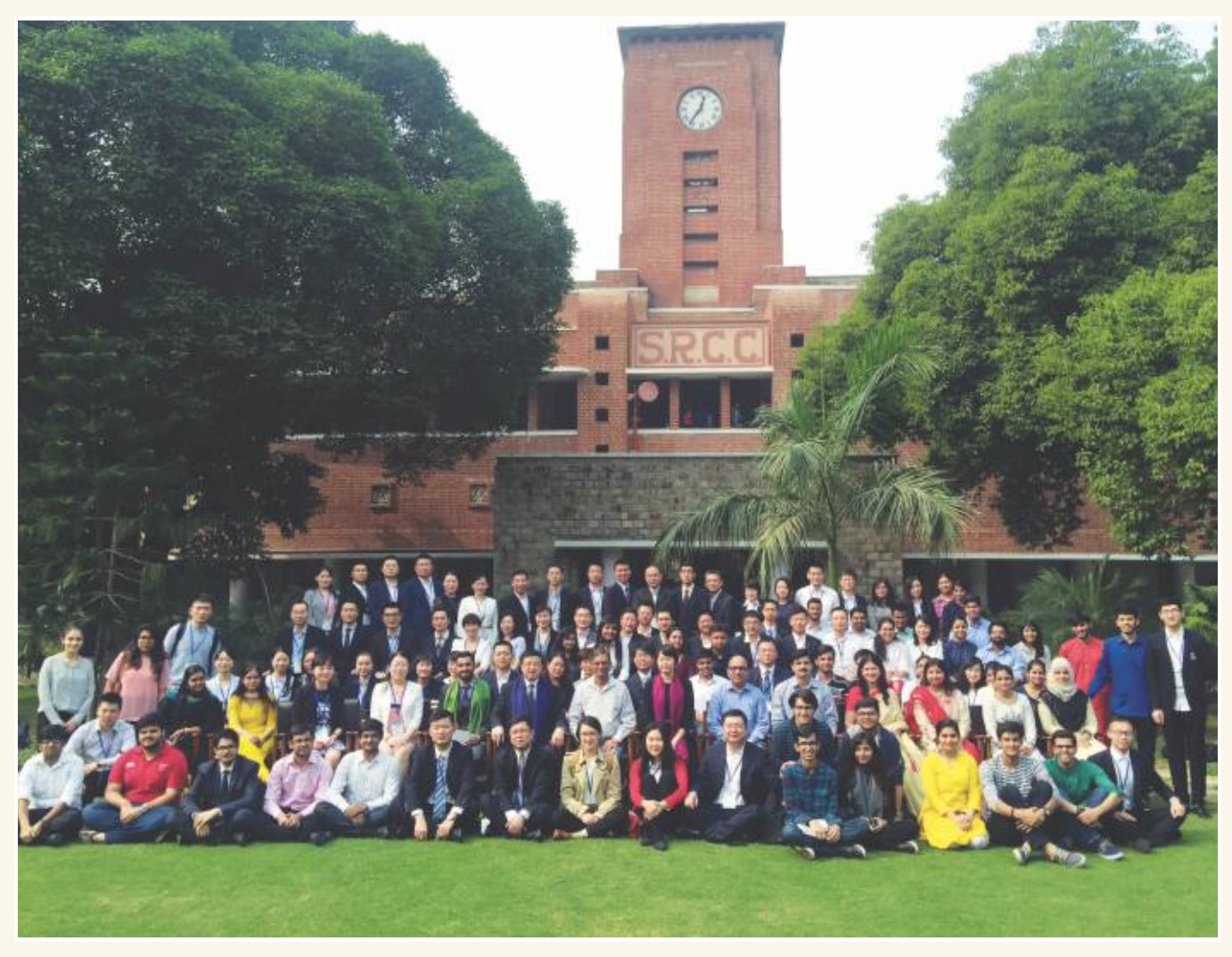
Participants of SRCC-MoY Indo China Entrepreneurship Meet

A delegation of 60 members from China participated in an Entrepreneurship Meet organized through the combined efforts of SRCC and Ministry of Youth Affairs and Sports. The meet included brief series of presentations by students depicting the blooming startup culture and entrepreneurial spirit of the country, along with some initiatives taken by the government to augment its impact. Presentations were also made by the students on the various start-ups in our college, followed by discussion on inter-cultural issues.