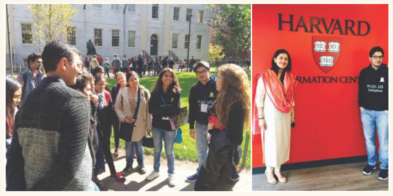
Harvard Business School, October 15, 2016