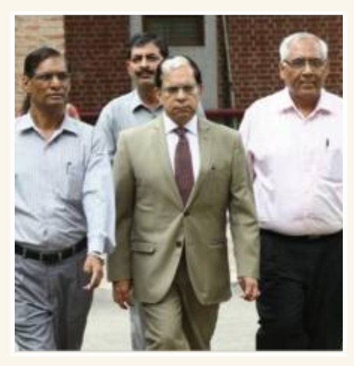
Justice A. Sikri Judge, Supreme Court