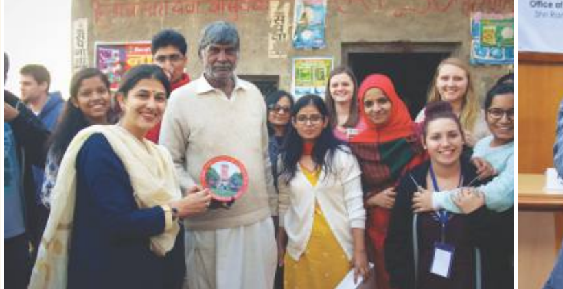
Visit to Nagli Razapur village