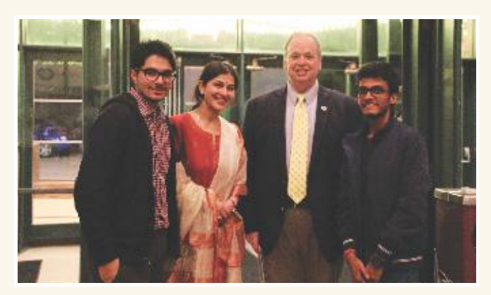
Interaction with UWEC chancellor, October 11, 2016