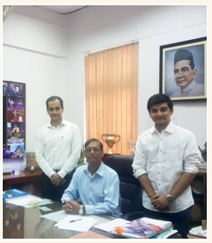
SRCC students selected for Y20 Summit, China

Two students of SRCC, selected by OIP, participated in the Youth Summit held in Beijing & Shanghai in China. The summit witnessed youth delegates from G20 countries, guest countries as well organisations such as World Bank, IMF and OECD. The theme of the programme was "Youth Innovation for Our Shared Vision". The aim of the programme was at formulating youth policy for the G20 Countries and putting forward the concerns of the youth. The outcome of the summit is a communique that is forwarded to the Heads of State of the G20 Countries for their consideration in formulating policy.