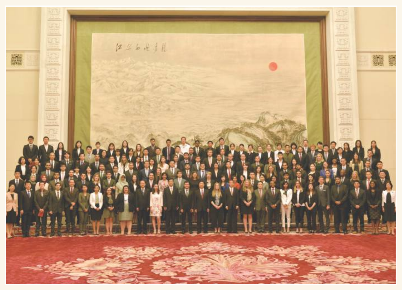
Delegates from G20 countries at Y20 Summit, China