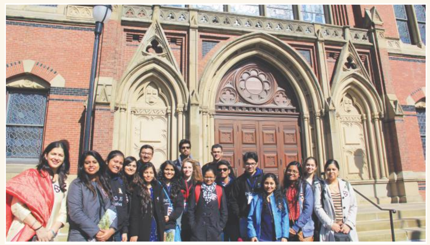
Harvard University, October 15, 2016

The next day brought with itself the realisation of a long cherished dream; a visit to the esteemed Harvard University. An official tour was arranged for the participants at the campus. There they interacted with the undergraduate student who briefed about the history of the University, the dorms and the college life. The participants were elated to meet alumni members of SRCC who took them around Harvard Business School (HBS), 'Hi' Harvard Innovation and learnt about so many differences and similarities between the education in India and abroad.