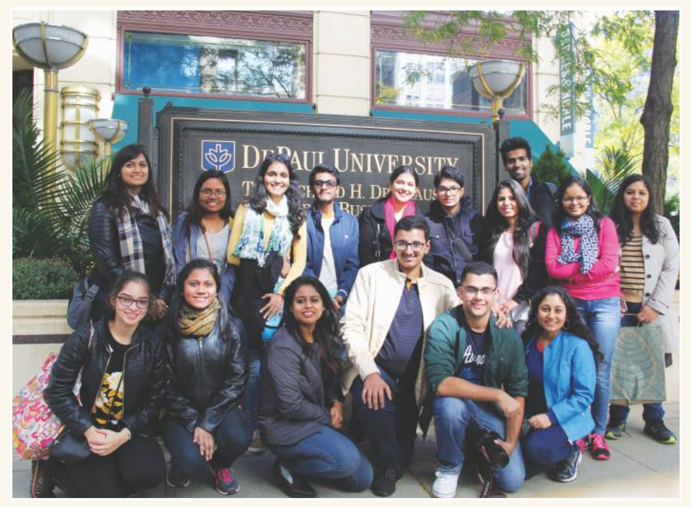
SRCC students at De Paul University, Chicago, October 8, 2016

On 8<sup>th</sup> October, the participants visited the campus of De Paul University in Chicago which is ranked amongst the top 25 most innovative schools in the U.S. The visit provided them an opportunity to learn more about the University and find answers to important questions regarding the future career choices, course structure, subjects offered and international internships.