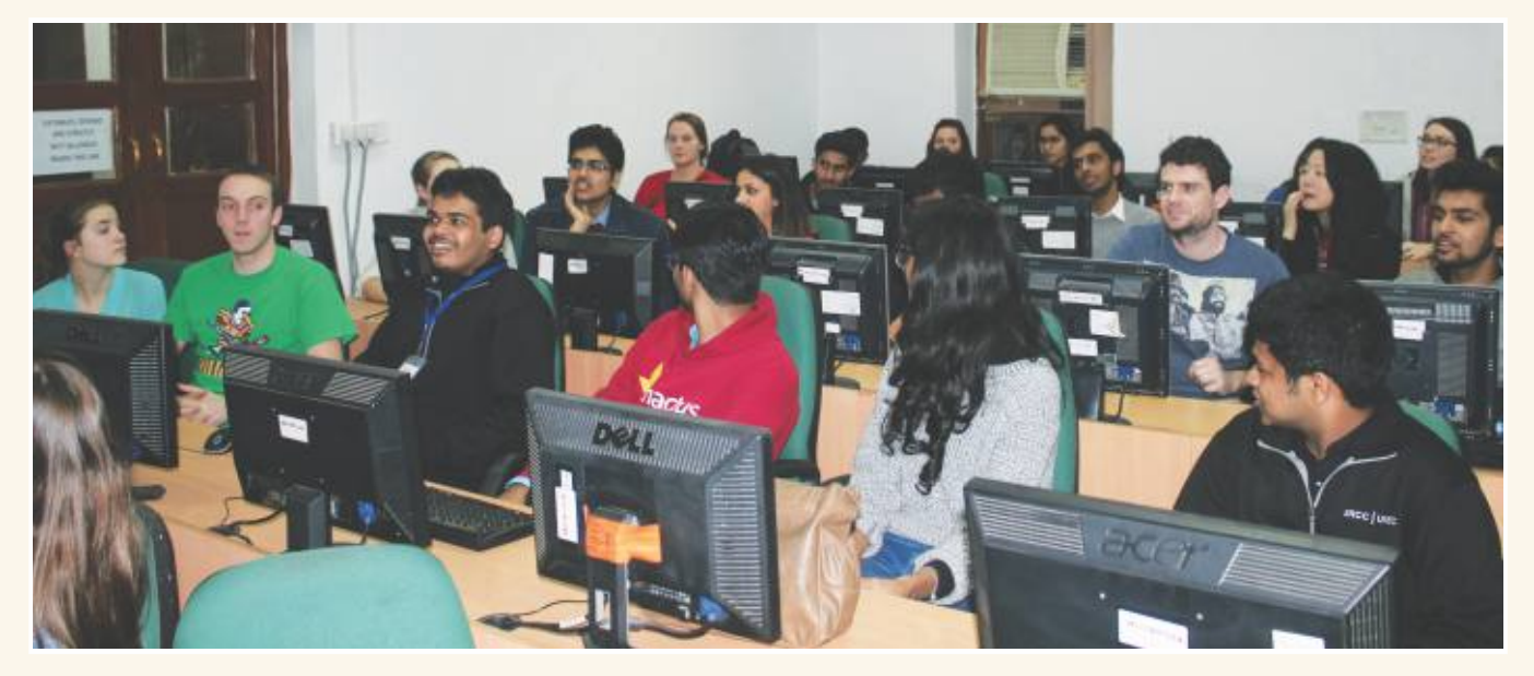
Participants of the Quiz