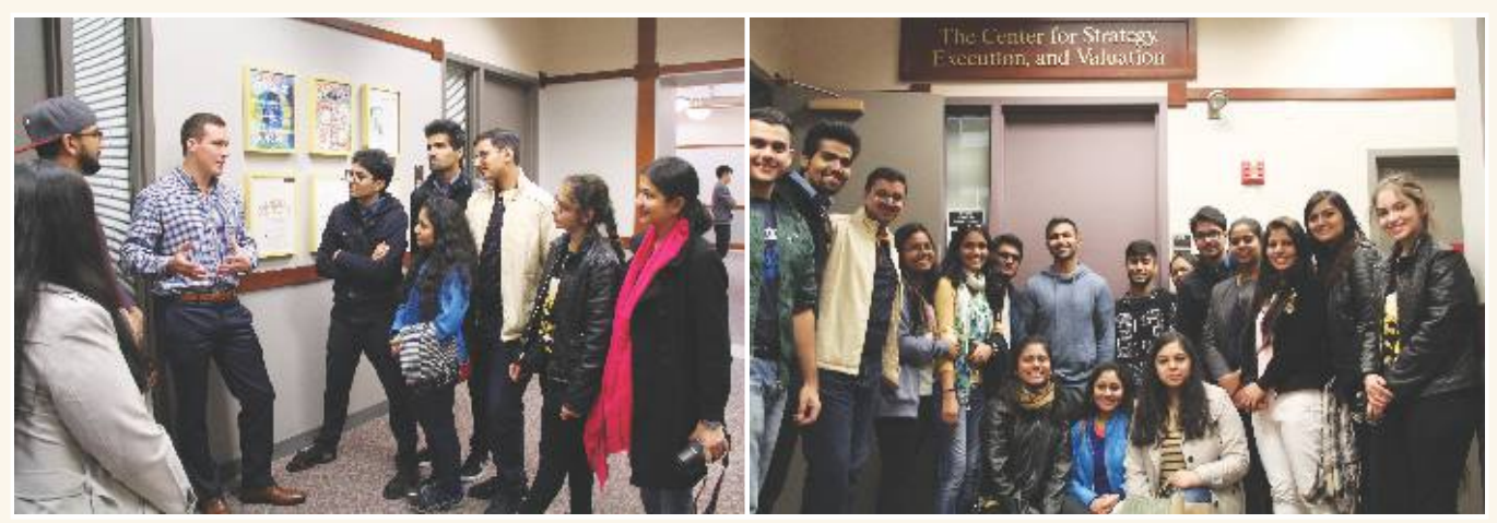
Interaction with faculty at De Paul University, October 8, 2016