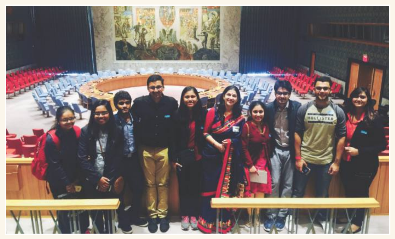
Security Council, United Nations, New York, USA October 20, 2016

On 20<sup>th</sup> October, the participants had an official tour of the United Nations headquarters. They were apprised about the functioning of the United Nations, the Security Council and the Sustainability Development Goals (SDGs).