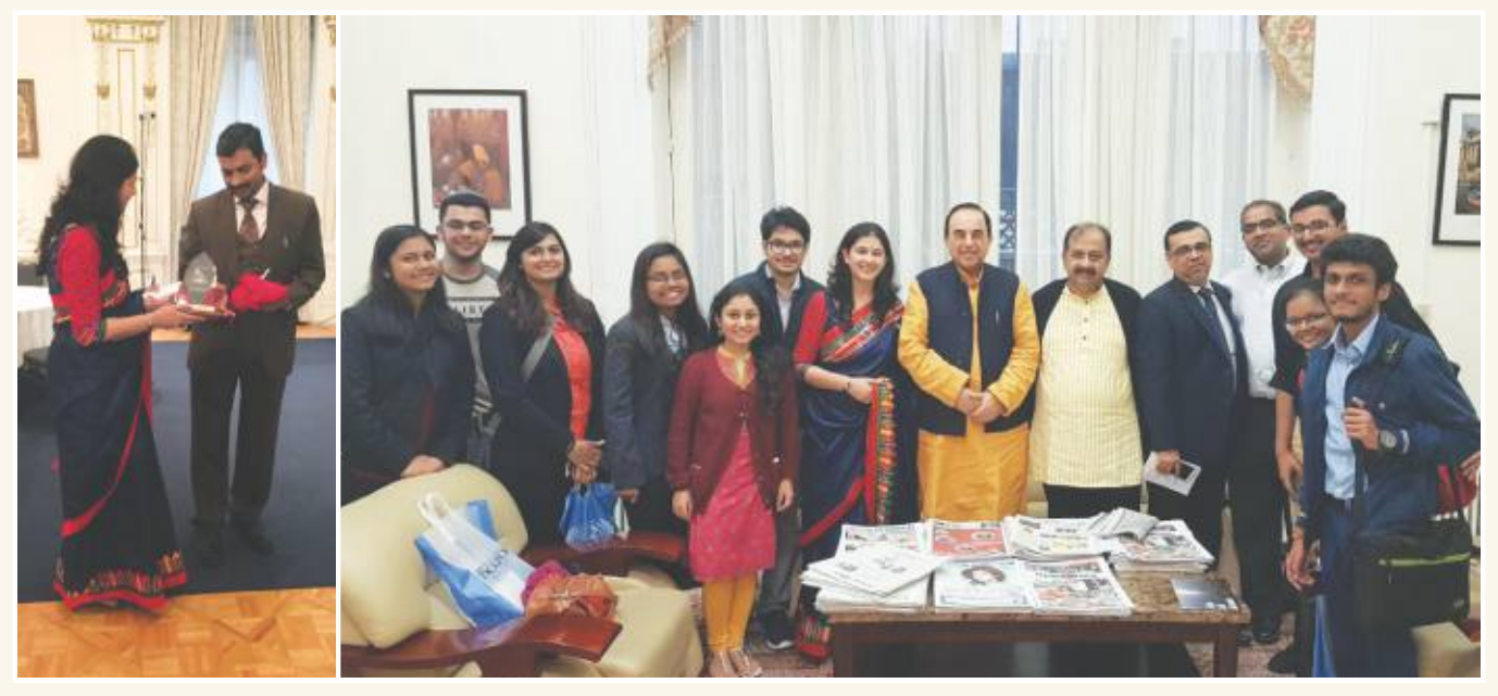
Presentation of memento to Indian Consular – Trade, Commerce and Education