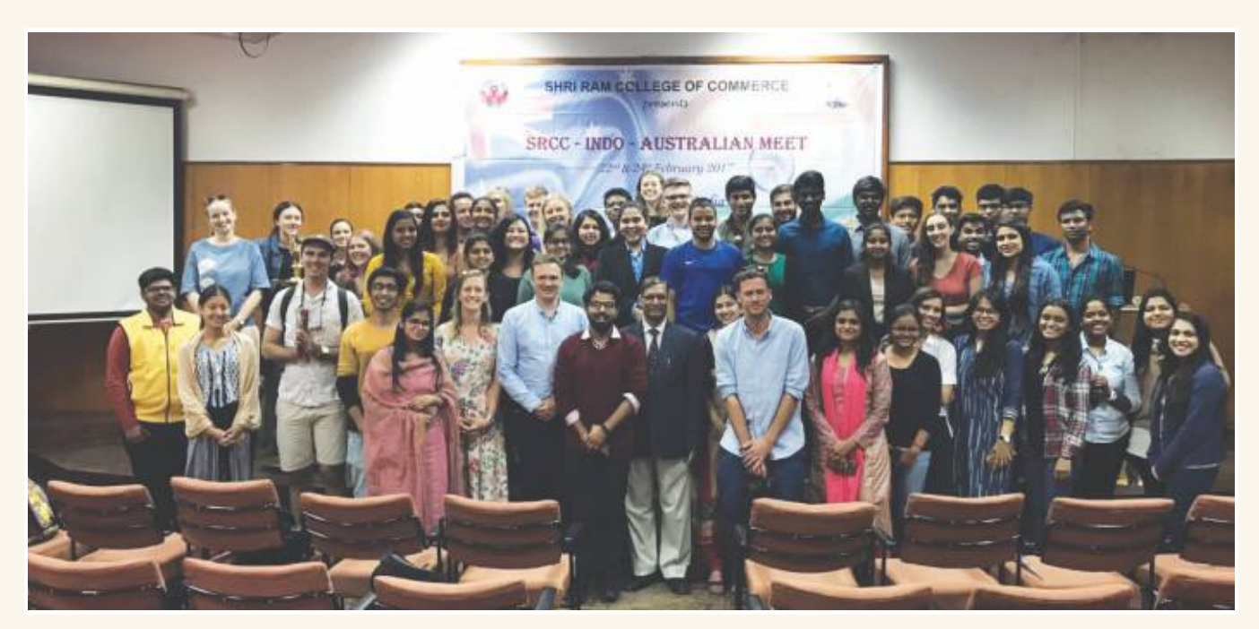
Participants of SRCC Indo Australian Meet