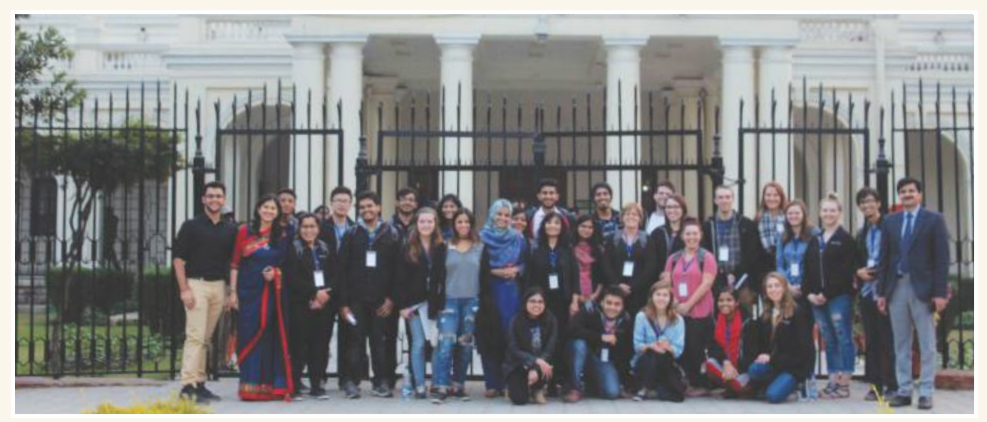
Vice Regal Lodge Building, the Vice-Chancellor's Office