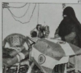
COLOURS OF FREEDOM: A woman in Hyderabad stitches national flags ahead of Independence Day

The birth anniversary of Pingali Venkayya, who had designed the Indian flag, is August 2. Modi said updating social media profiles with the tricolour will also be a mark of re-