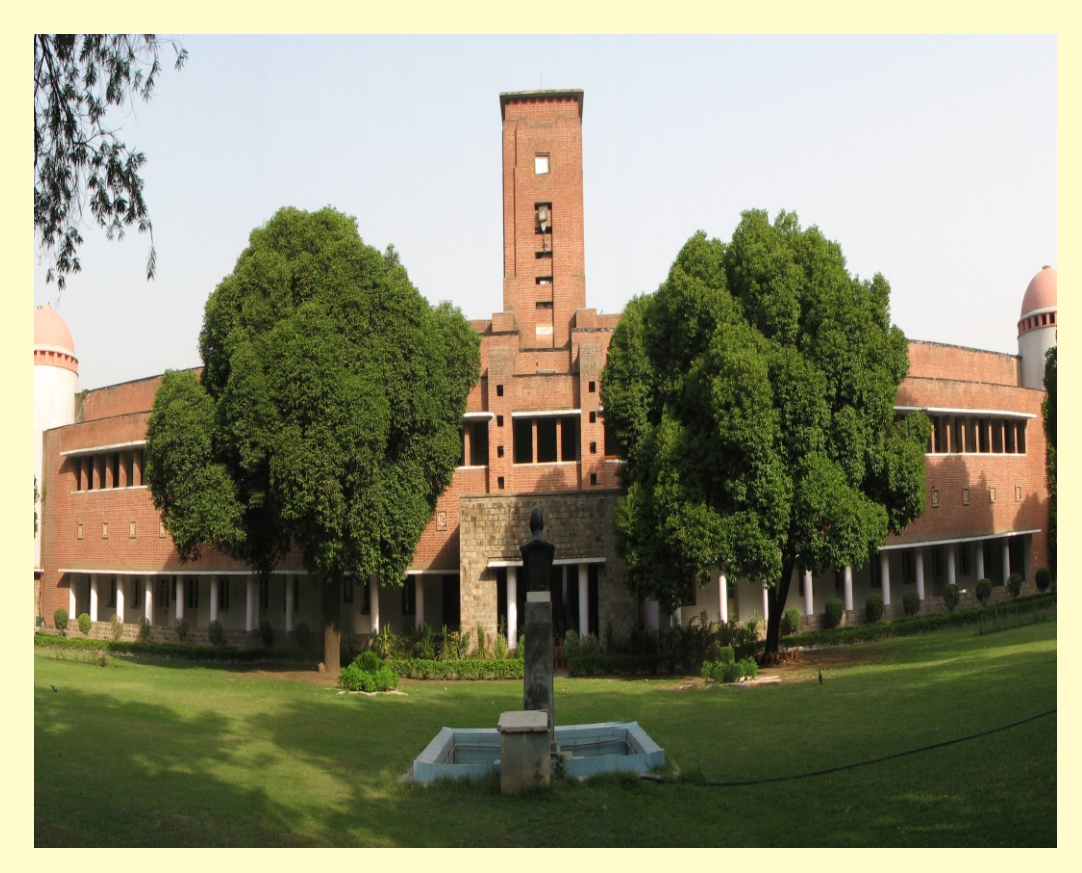
STUDENT-FACULTY EXCHANGE PROGRAMME COMMITTEE SHRI RAM COLLEGE OF COMMERCE UNIVERSITY OF DELHI