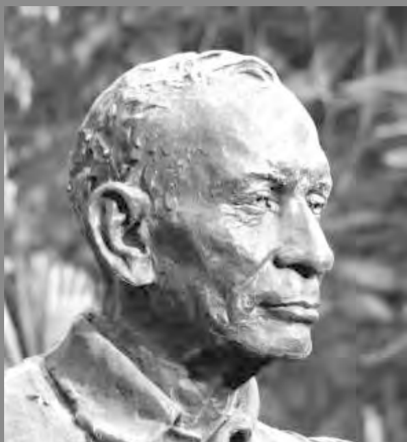
FOUNDER OF THE COLLEGE SIR SHRI RAM 1884-1963